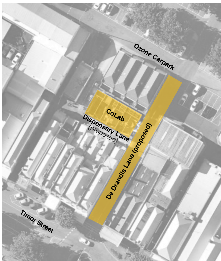
Figure 3 - Proposed De Grandis Lane

The De Grandi's were well known for their sports goods store which operated at 178-182 Timor Street (De Grandi's Sportsgoods Store). After 114 years of family ownership, the store closed in 2011 (business was founded in 1897 by Lou De Grandi). Today, the former De Grandi's Sportsgoods Store sign is proudly maintained in the laneway.