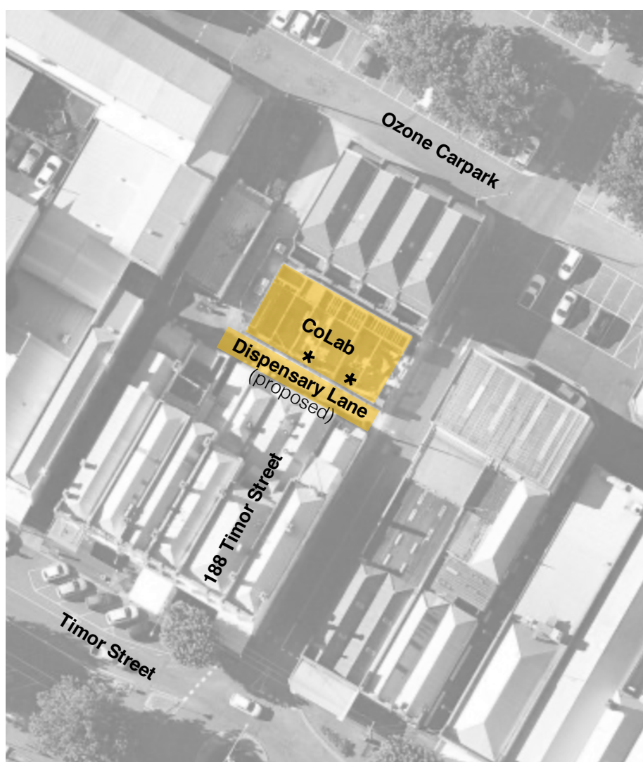
Figure 1 - Proposed Dispensary Lane

Our development will be accessed from this laneway, with two pedestrian access points to the building - the main entry to CoLab and a secondary entry for the cafe (marked with an asterisk above). We intend to re-seal the laneway prior to completion of the development (expected to be around October 2022).