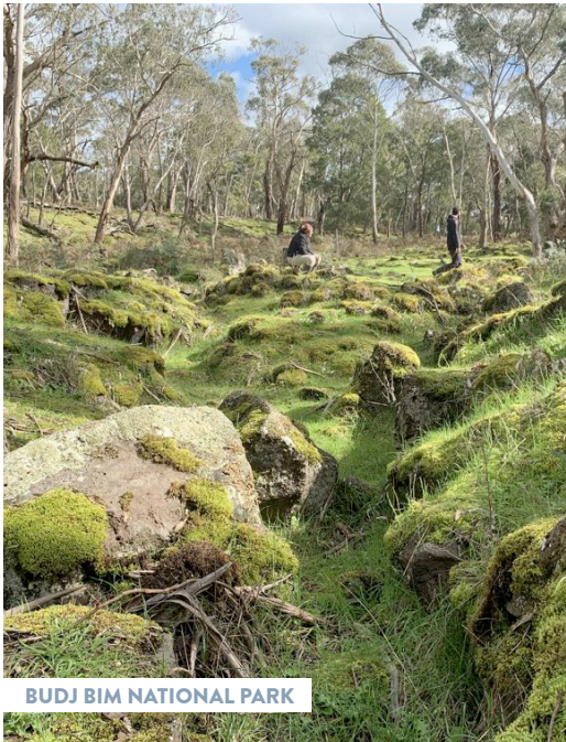
BUDJ BIM NATIONAL PARK