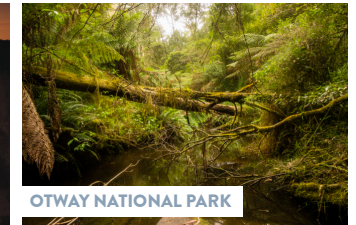
OTWAY NATIONAL PARK