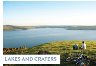
LAKES AND CRATERS