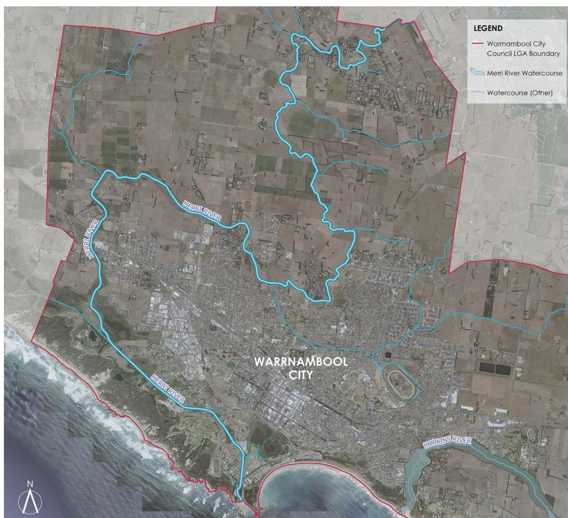
Figure 1. The main stem of the Merri River in Warrnambool.