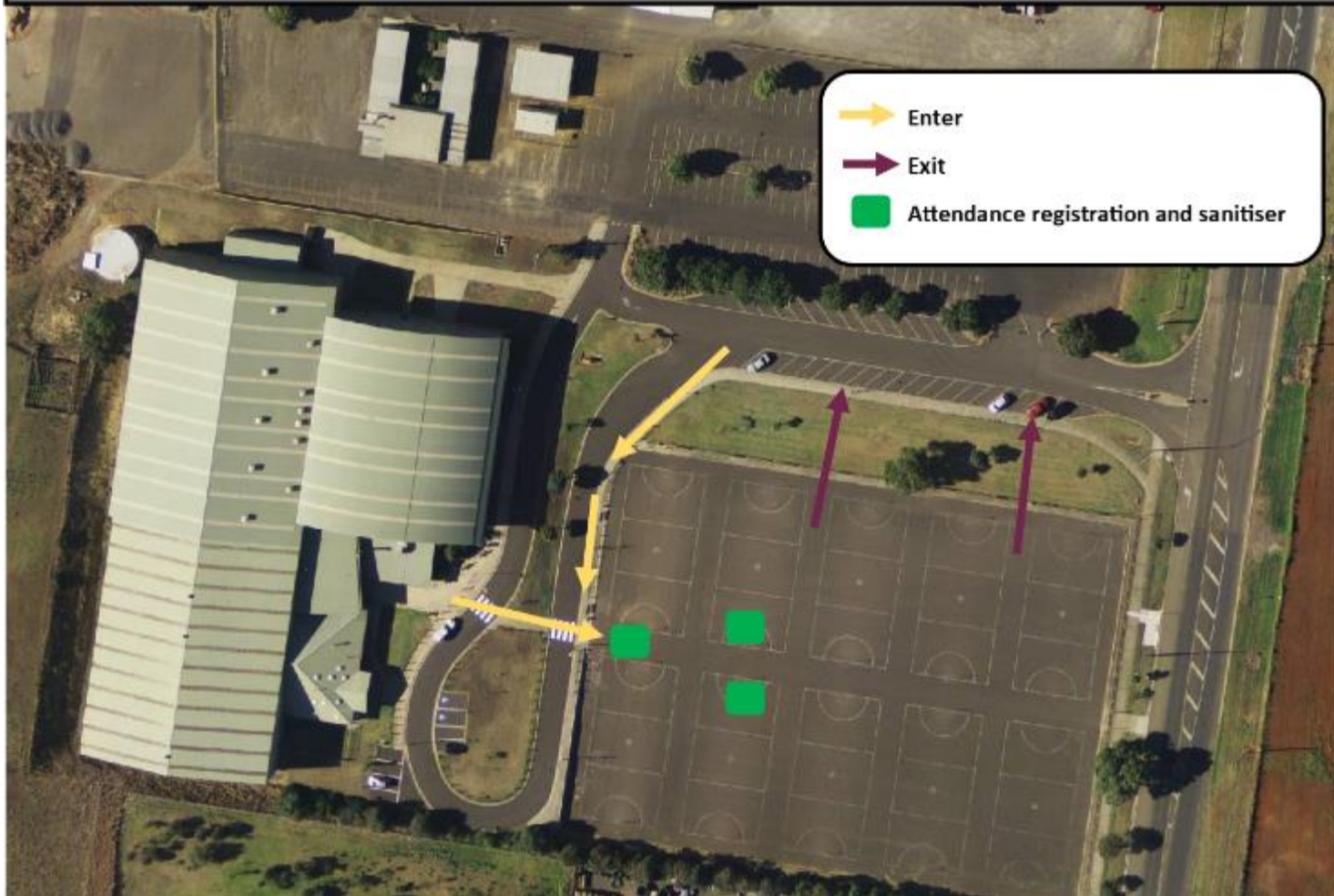
Access plan for outdoor courts: