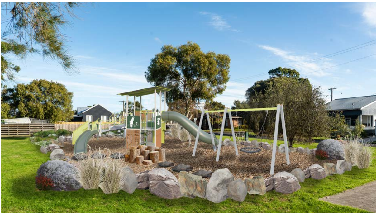
Concept image of renewed playground.