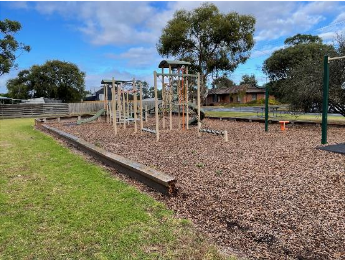
Picture above shows existing playground and edging/seating in poor condition.