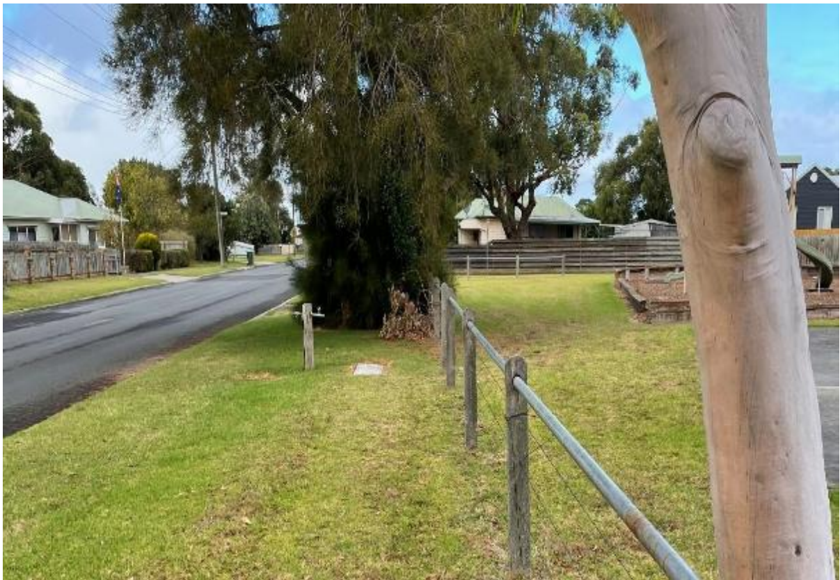
Picture above shows bubbler outside the fence and close to Tooram Road.