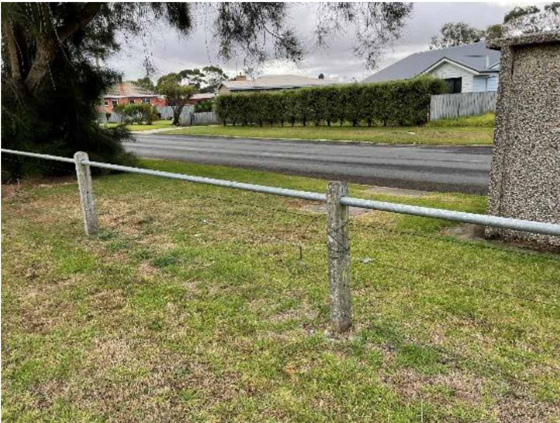
Picture above shows existing fencing which is in poor condition and not as effective as proposed wire panel fencing.